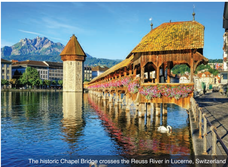
The historic Chapel Bridge crosses the Reuss River in Lucerne, Switzerland

DAY 8 Breisach, Germany / Freiburg: On today's adventure, visit the city of Freiburg, considered the 'capital of the Black Forest'. Aside from seeing the lovely sights, sample true Black Forest delicacies from the lively market in the city center near the main cathedral. Alternatively, join a guided bike tour in Breisach. Meals: B, L, D