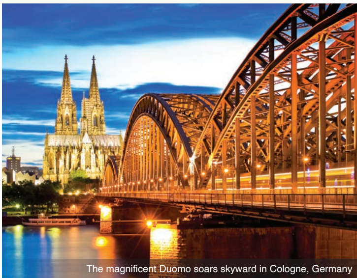
The magnificent Duomo soars skyward in Cologne, Germany