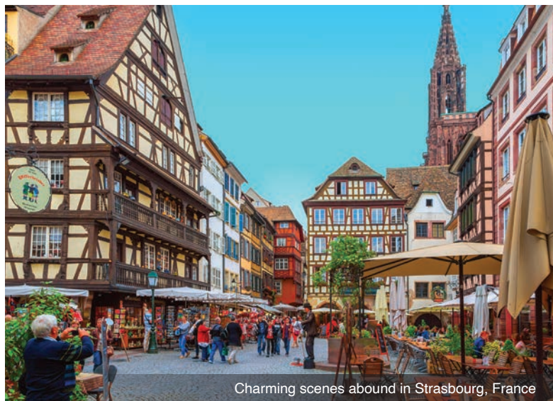
Charming scenes abound in Strasbourg, France

DAY 1 Depart the USA: Depart the USA on your overnight flight to Amsterdam, the Netherlands.