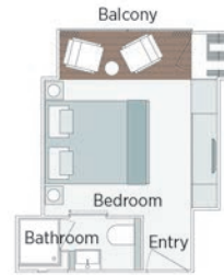
Panorama Balcony Suite