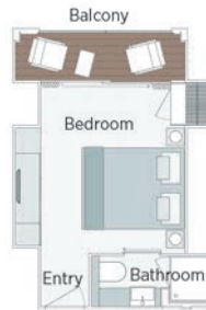
Grand Balcony Suite