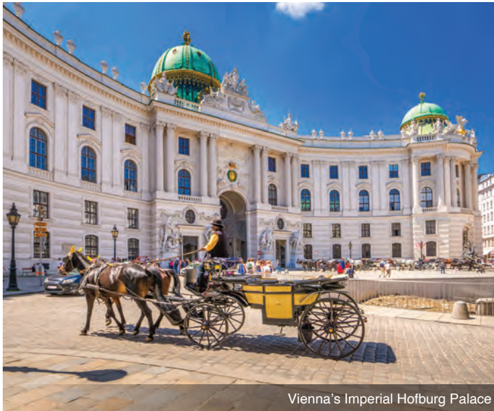
Vienna's Imperial Hofburg Palace