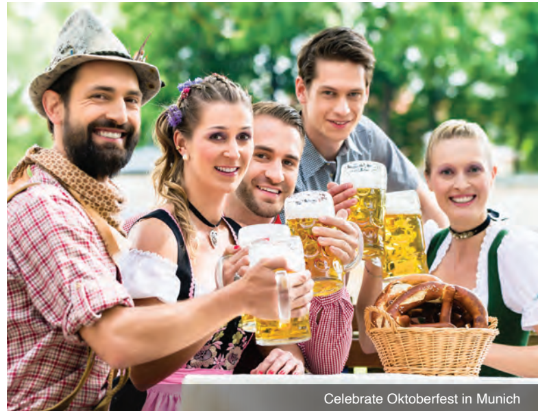
Celebrate Oktoberfest in Munich

DAY 1 Depart the USA: Depart the USA on your overnight flight to Budapest, Hungary.