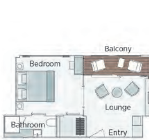
Owner's One-Bedroom Suite