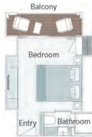
Grand Balcony Suite